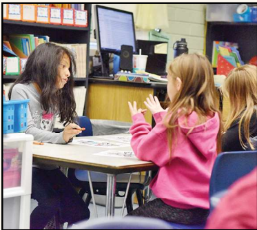
Levy funds support learning opportunities for students. This photo was taken in the 2019-2020 school year.