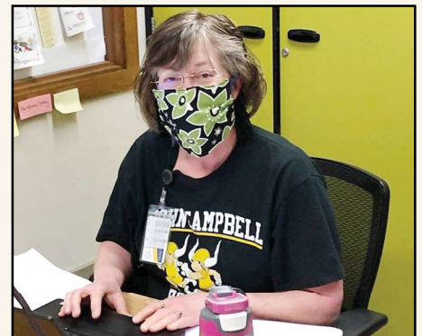
Levy funds approved in 2019 have been valuable to students and families, such as for nursing support.

The last day for eight-day mail or online voter registrations and changes is February 1 . The deadline for new, in person only, Washington State voter registration is February 9 . In person means you must apply at the county auditor's office. For more information, visit www.yakimacounty.us .