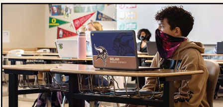
Levy funds help provide for educational support such as for student technology 1:1 devices.

*Although our student-athletes are not currently on the fields and courts, the levy category of Athletics and Activities is targeted as a funded item because this levy renewal request will not collect until 2022, when athletes will be competing.