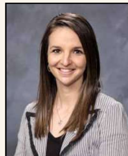
Tiffany Fife Selah Intermediate