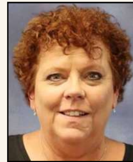
Jean Pearson Transportation Services